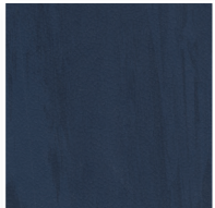
Marine Blue - 986