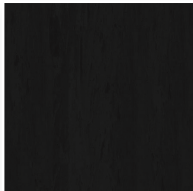
Solid Black - 790