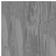
Grey Marble - 76