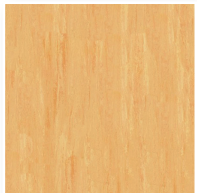
Maple - 81