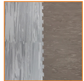
FitZone Home & FitZone Premium Home Interconnected