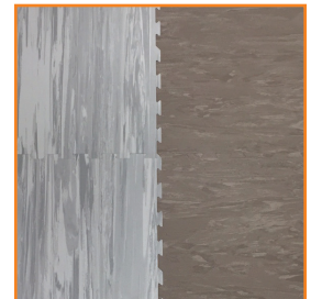
FitZone Home & FitZone Premium Home Interconnected