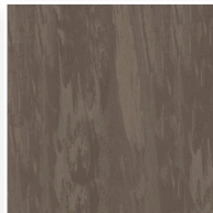
Mahogany - 96